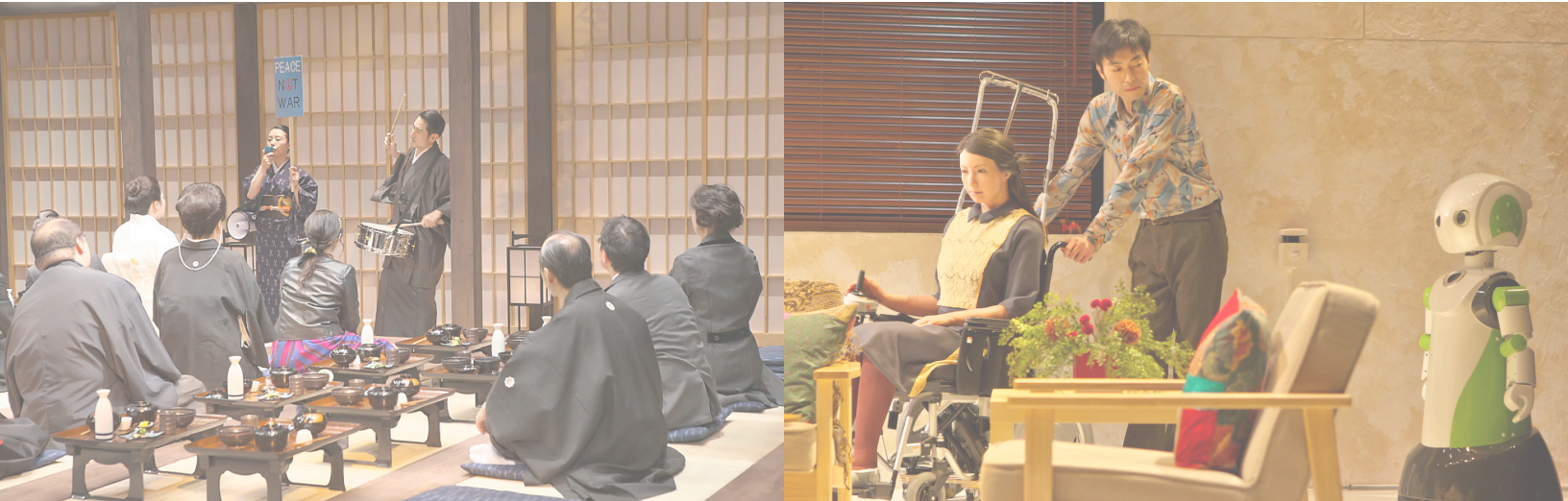
Scenes from "The Rise and Fall of Japanese Literature" and "Three Sisters"

“What is literature?” “What is modern?” “Can literature exist in Japan?”